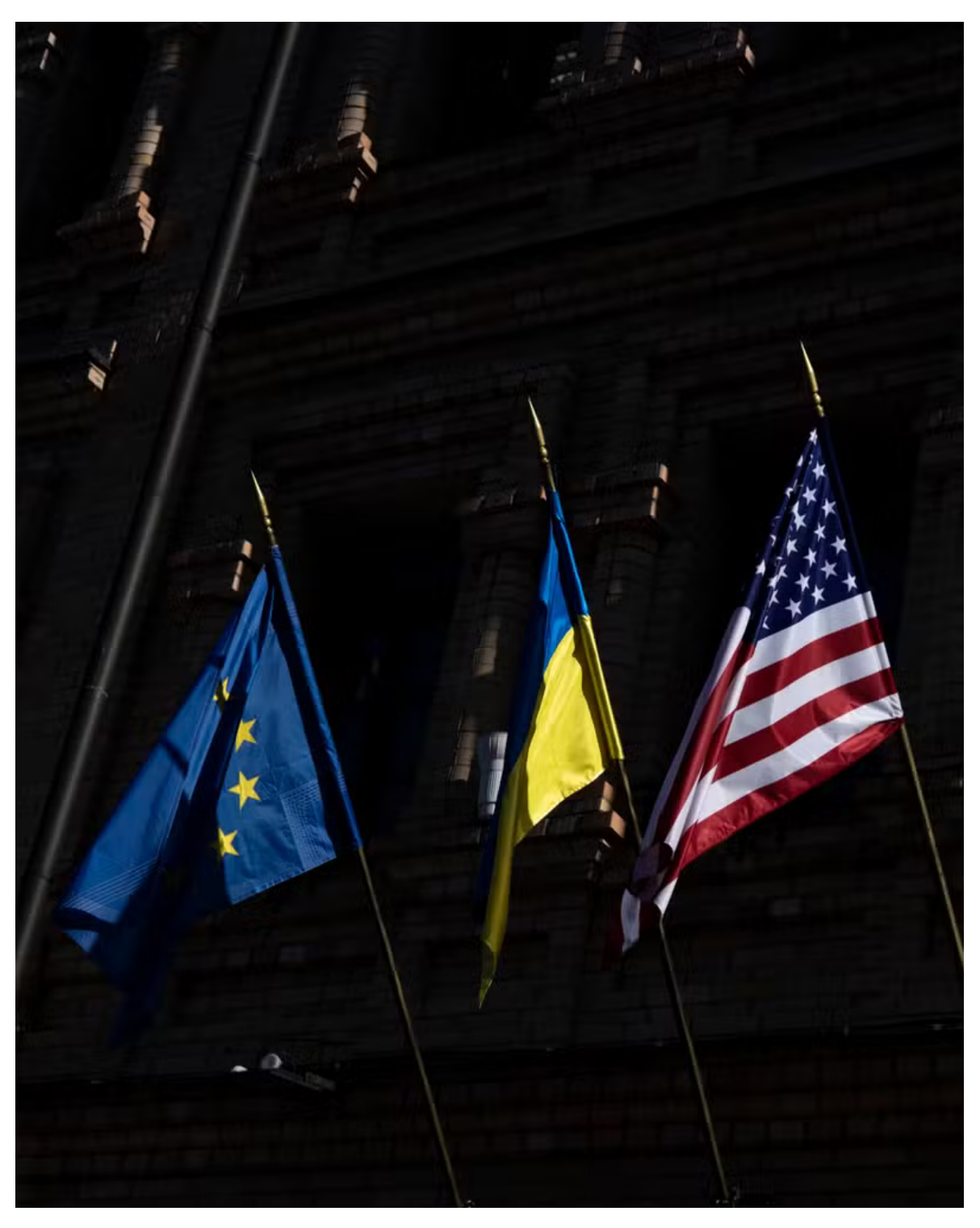
Flags of the European Union, Ukraine and the United States, Kyiv, February 18, 2025.

"A Dictator without Elections, Zelenskyy better move fast or he is not going to have a Country left," the US president went on. This was in addition to the previous day's outburst when he falsely claimed that the Ukrainian leader only had a "4%" approval rating.